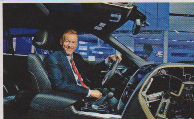
Ford's Mulally The road ahead could get bumpy

Green stocks: Bright prospects for energy-efficiency plays p52 Easy money brings buyouts back to life p53 China stocks may soon rally 55 Bid & Ask: The week's deals p56